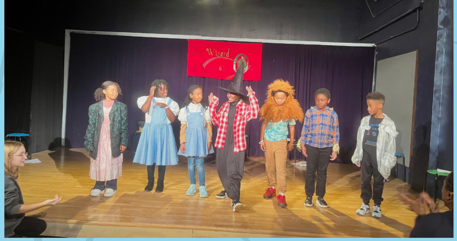
Chapter Programming is the "heart" of the organization. It is the way that we "create a medium of contact for children that stimulates growth and development." The Programming Team has been busy this summer preparing to welcome our and children with exciting, innovative, and culturally centered activities.